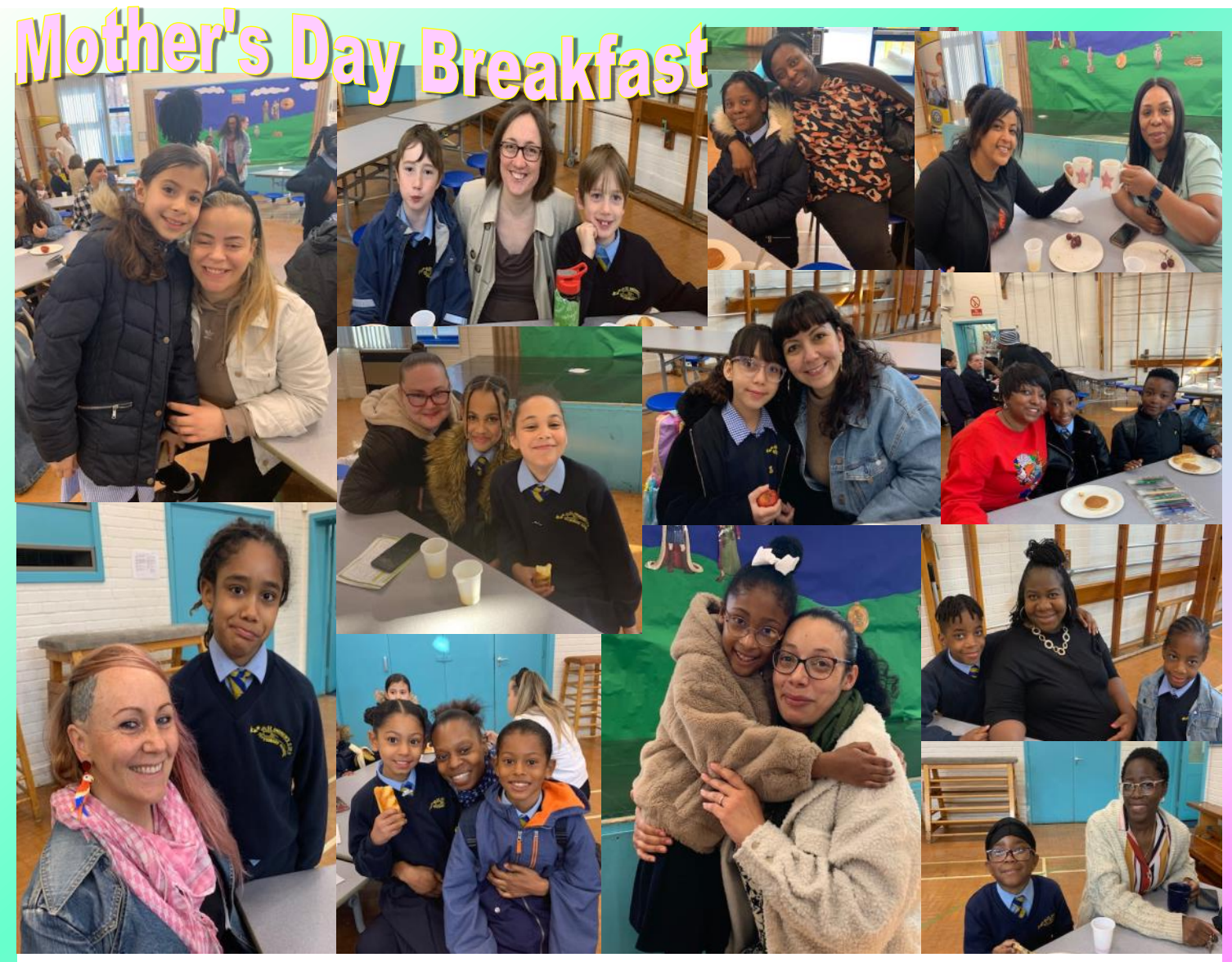
It is clear to see, from the pictures of our Mothers Day Breakfast held this morning, who our children get their good looks from... sorry Dads!