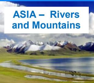
ASIA – Rivers and Mountains