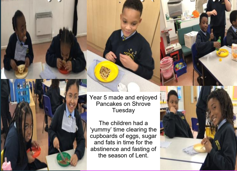
Year 5 made and enjoyed Pancakes on Shrove Tuesday

The children had a 'yummy' time clearing the cupboards of eggs, sugar and fats in time for the abstinence and fasting of the season of Lent.