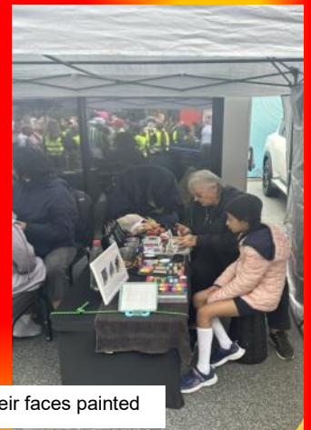
Getting their faces painted