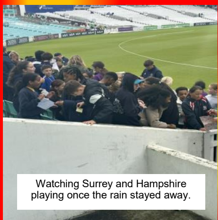
Watching Surrey and Hampshire playing once the rain stayed away.