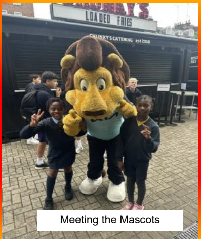
Meeting the Mascots